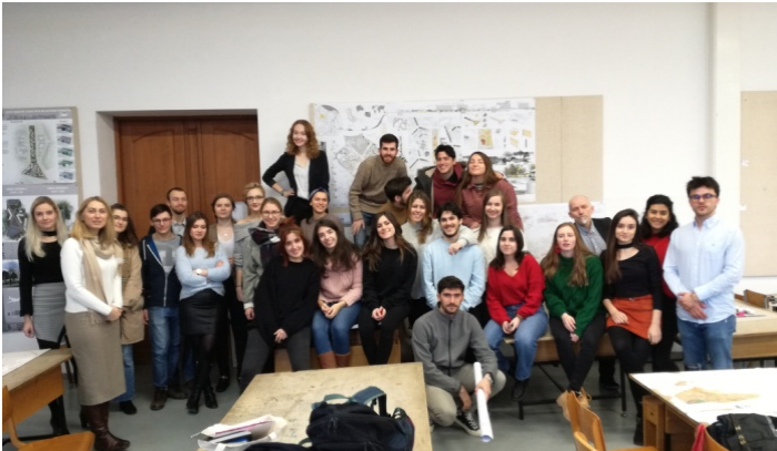
Figure 3: Final presentation of students' designs (Source: Author's images).

Working on the integration of urban and environmental solutions students developed original concepts. Among them were projects that presented new concepts for spatial development in an interesting way, with a special emphasis on public space. The best projects showed an integration of existing and designed space through the arrangement of public space, the role of which was revitalisation (of the space). Some projects incorporated attractors in the form of various functions (e.g. commercial, cultural, entertainment). In others, the creation of new connections was represented, to minimise existing barriers. The inclusion of sport and art as elements of public space also played an important role in students' designs. Public spaces are important in promoting a healthy lifestyle and encouraging various activities (Figures 3 and Figure 4) [11].